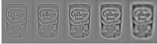
Figure 2: Example DoG pyramid for model_chickenbroth.jpg