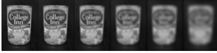
Figure 1: Example Gaussian pyramid for model_chickenbroth.jpg