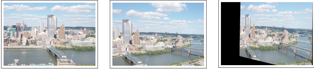
Figure incline.L.jpg (img1)