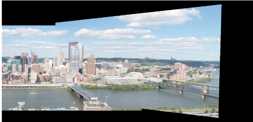
Figure 6: Final panorama view. With homography estimated using RANSAC.

Run your code on the image pair data/incline_L.jpg , data/incline_R.jpg . However during debugging, try on scaled down versions of the images to keep running time low. Save the resulting panorama on the full sized images as results/q6_3.jpg . (see Figure 6 for example output). Include the figure in your writeup.